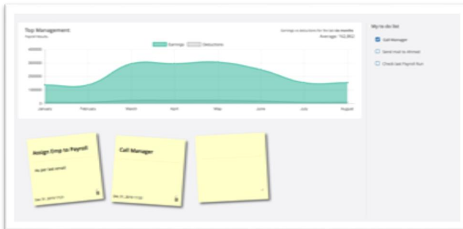
Figure 4: Sample Admin Dashboard

Using the startup with the admin Dashboard, you can check visually the results of the previous month and you can easily make a To-Do list, for example listing the monthly Payroll preparation tasks, moreover you can add multiple sticky notes to keep track of any related tasks.