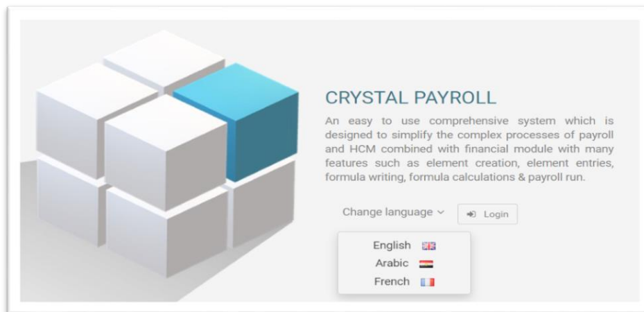
Figure 1: Multi-Language Support